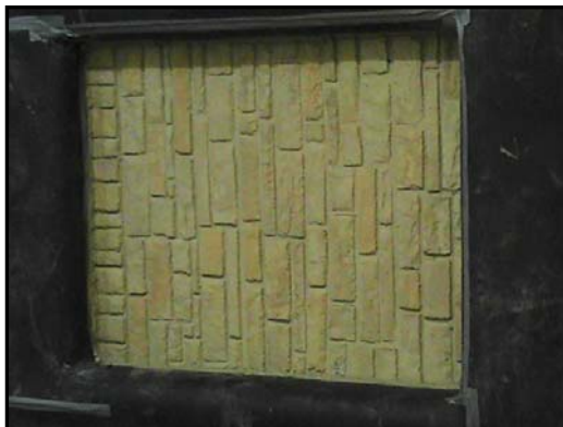
Concrete Panel in Test Wall

The specimen was identified by the client as Ledge Stone, a Concrete Panel manufactured by Fabcon, Inc. The panel measured 48" x 60" x 6" nominal thickness. The front and rear surfaces had a natural stone appearance.